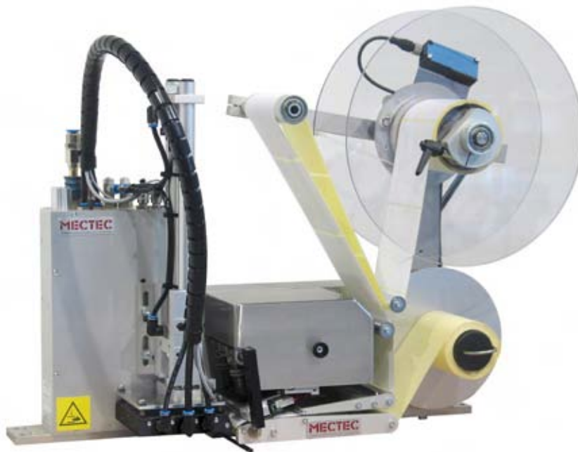
Printer and applicator in right hand version