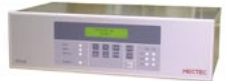
Printer Control Unit PCU III