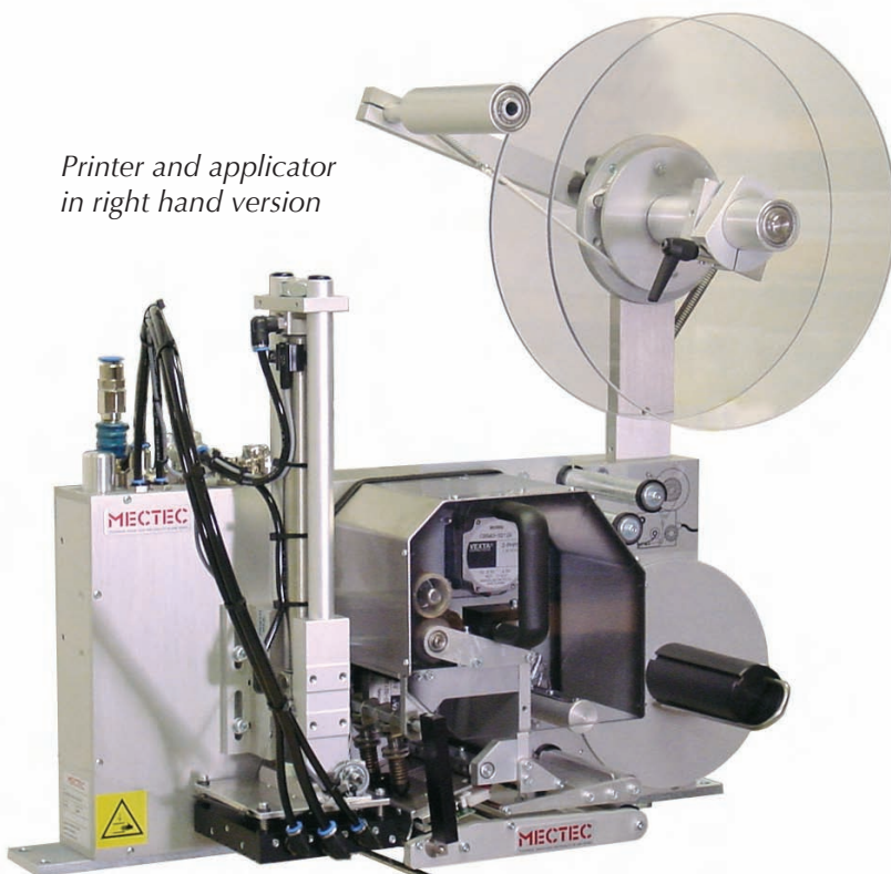
Printer and applicator in right hand version