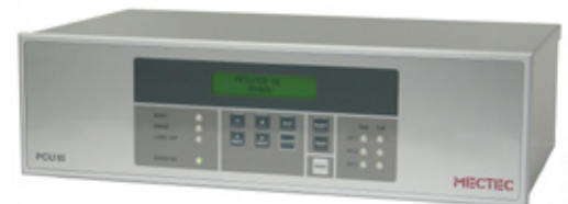
Printer Control Unit PCU III